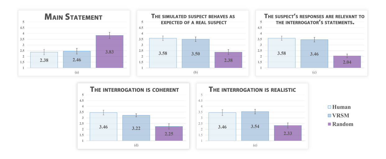
Figure 4: Experiment's Results